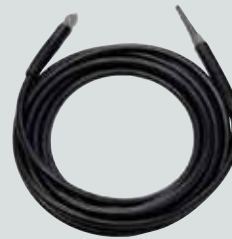
Drain cleaning kit, with .0500 nozzle Unblocking drains, toilets and pipes is child's play with our easy to use drain cleaning kit, hose 20 m DN10. Item no.: 6401266