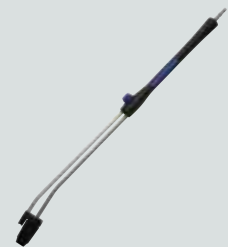
PowerSpeed Plus lance The Powerspeed Plus lance offers multiple benefits and effects. Rotary jet nozzle increases cleaning performance over larger surfaces. Various nozzle sizes, .0370, .0400, .0500, .0530.