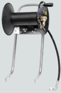
Hose Reel - MC PE Ease of storage for your high pressure hose and protection against damage. For 15 m DN8 hose, or 20 m DN6 hose. Incl. 0.7 m connection hose. Item number : 106403175