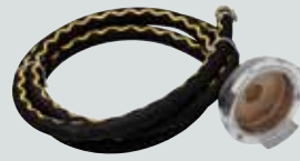
Suction dirt filter, with 3 m hose 3/4" Mesh size 0.8 x 0.32 mm. Item no.: 61256