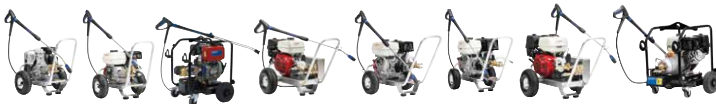
MC 2C-180/700 PE

The large, pneumatic wheels ensure good maneuverability over uneven ground as found around farms and building sites.