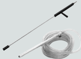
Sandblasting with rubber nozzle Stripping paint or rust is quickly done with the Nilfisk sandblasting kits. Item no.: 6401192 (.0450 nozzle) Item no.: 6401364 (.0500 nozzle) Sand plunger complete 6400375