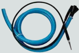
Water suction kit up to 300 l/min The Water Suction Kit is ideal for emptying flooded basements, tanks or pools. It can extract up to 20 mm, sludge, dirt, sand, stones, algae and others. Item no.: 6402017